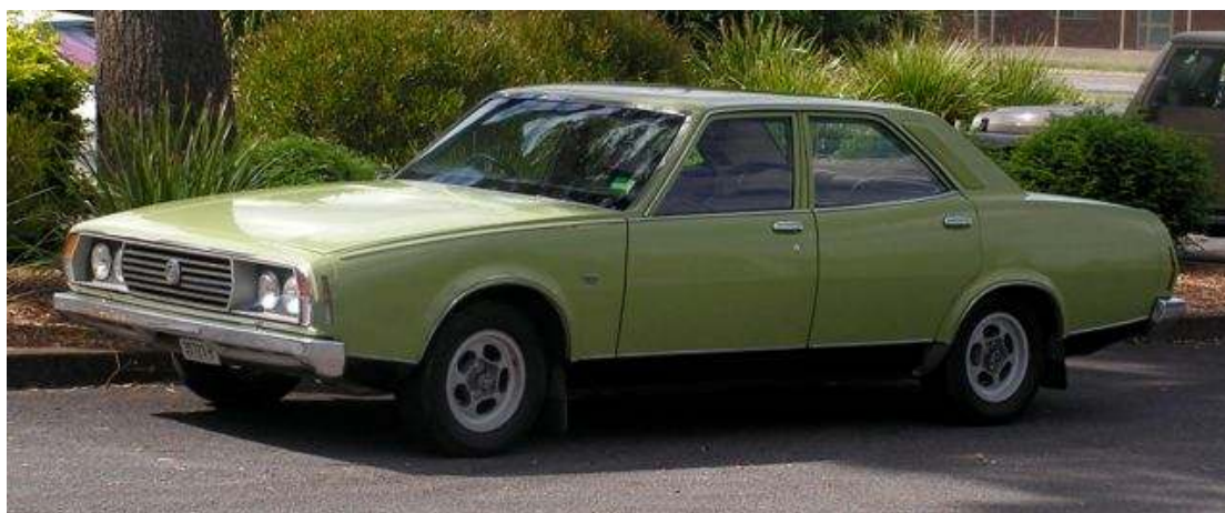
A nice Spanish Olive car, with Targa mags.