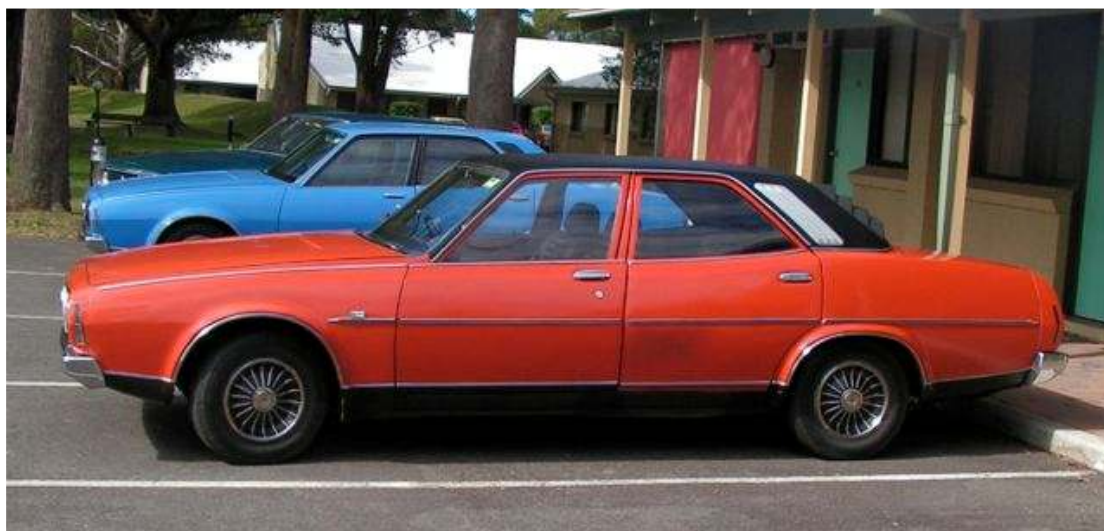
I also saw this nice Bitter Apricot vinyl roofed car, with Series II hub caps.